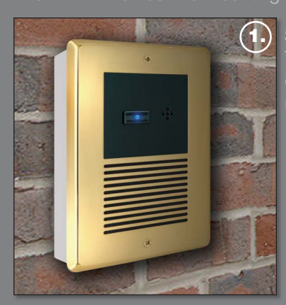
Surface Mounting. The Doorphone can be easily mounted onto